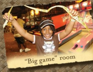
"Big game" room