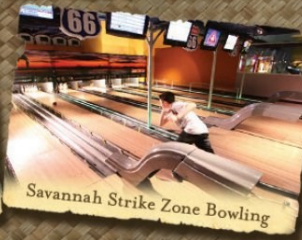
Savannah Strike Zone Bowling