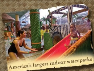
America's largest indoor waterparks

Mark your calendar to take a break!! Get away without going too far from home to America's LARGEST indoor waterpark and enjoy a special rate for families and friends! Rooms are ONLY $149 and feature 2 Queen beds and INCLUDE waterpark passes! A portion from EACH room booked will benefit Marvelous Faith Ministries/The Couples Club. BOOK on or before May 19, 2022 to avoid being shut out. Book online today! https://book.passkey.com/event/50277303/owner/49785631/home