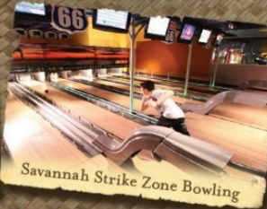
Savannah Strike Zone Bowling