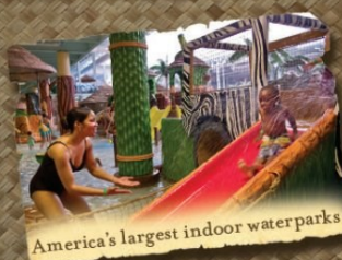
America's largest indoor waterparks

Mark your calendar to take a break!! Get away without going too far from home to America's LARGEST indoor waterpark and enjoy a special rate for families and friends! Rooms are ONLY $149 and feature 2 Queen beds and INCLUDE waterpark passes! A portion from EACH room booked will benefit Marvelous Faith Ministries/The Couples Club. BOOK on or before May 19, 2022 to avoid being shut out. Book online today! https://book.passkey.com/event/50277303/owner/49785631/home