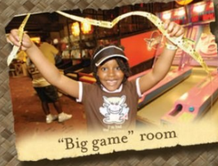
"Big game" room