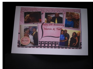
The Smith's 50th Anniversary Card for The Couple's Club!!! PRICELESS!!!