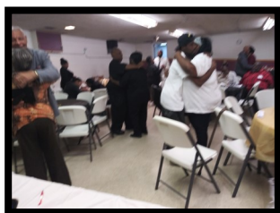
"One In A Million" Dance at the October RESCU Group